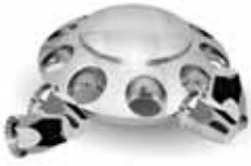
Front Chrome Hubcap Cover Kit Part #69635