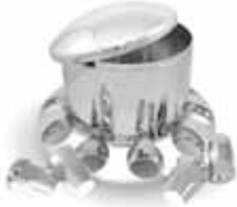
Rear Chrome Hubcap Cover Kit Part #69636